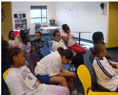
Members wait anxiously for their turn to spell in the mock spelling bee.